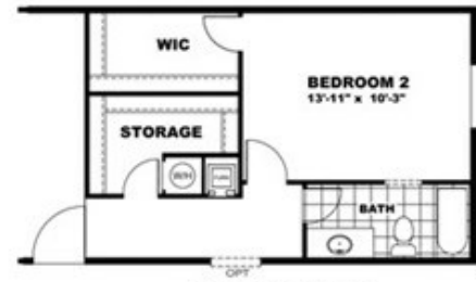
2 BEDROOM OPT.

Our home building facilities invest in continuous product and process improvements. Plans, dimensions, features, materials, specifications and availability are subject to change without notice or obligation. Renderings and floor plans are representative likenesses of our homes and may differ from the actual homes. We invite you to tour a Home Center near you and inspect the highest value in quality housing available or call (252) 756-5434 to speak with a Home Consultant. Copyright 2017, CMH. All rights reserved.